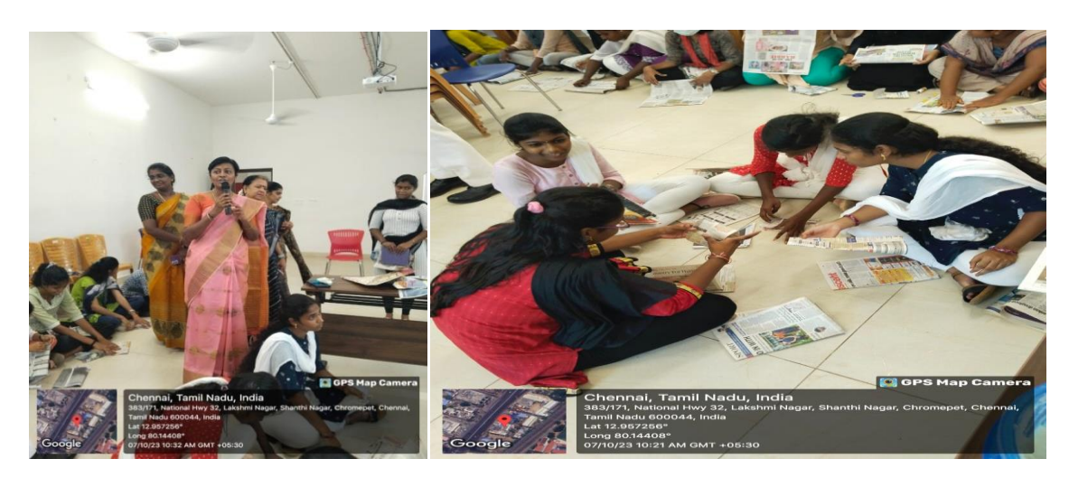
DENGUE AWARENESS RALLY